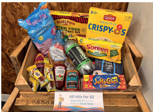
Example of a £5 small shop

We know choosing the items you like for your family is really important and so we have thousands of products to select from each week with new lines added each day.